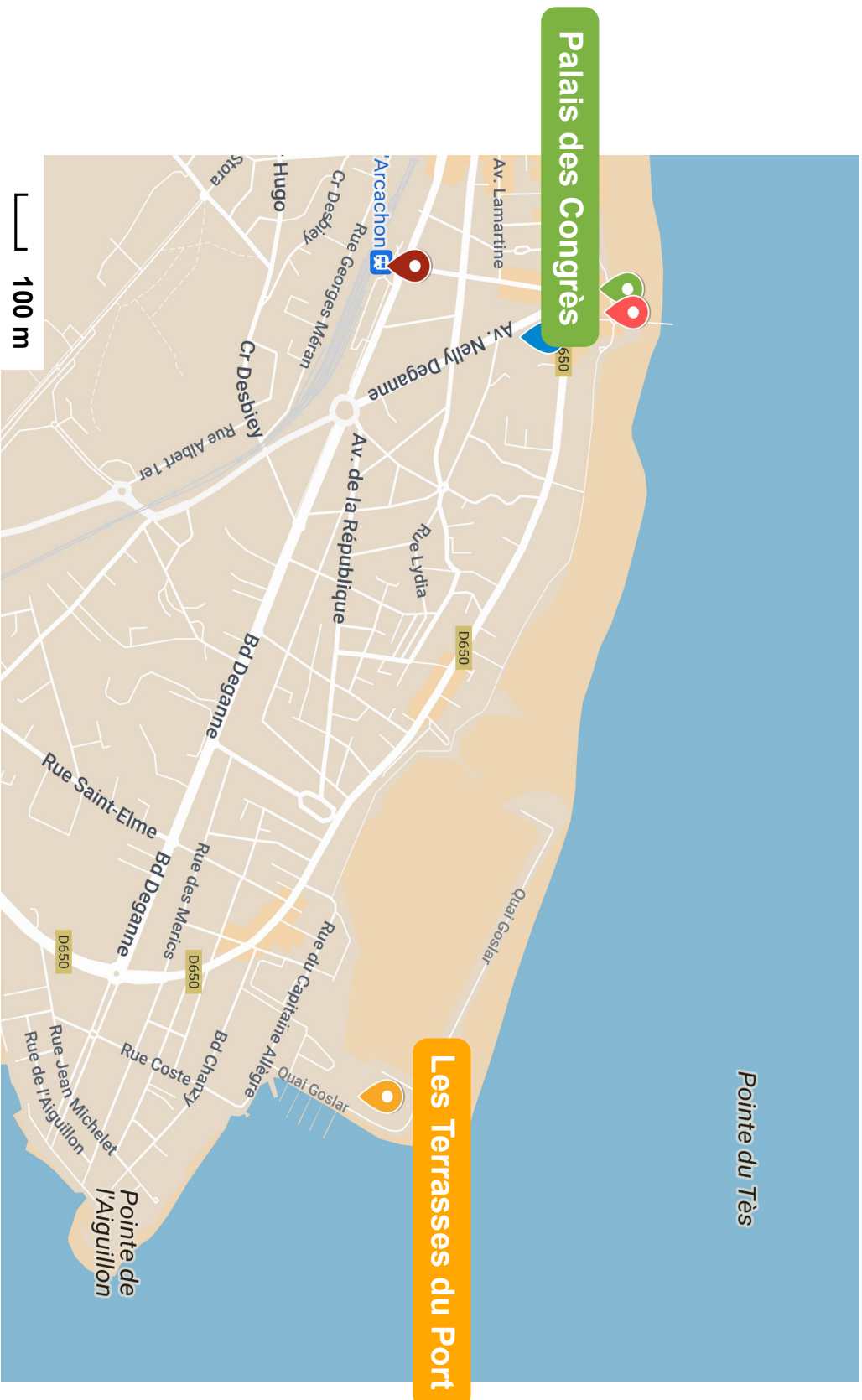
Map 2 - The Tuesday evening reception will take place at Les Terrasses du Port . The restaurant is located on the sea front, 2 km (25 mn walk) far from the Palais des Congrès (East dir.).