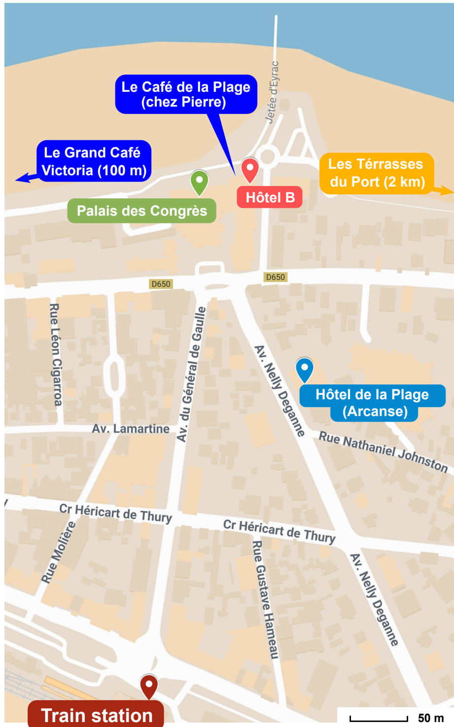
Map 1 - Main area. Access to the Palais des Congrès and to the hotels from the train station. Monday and Tuesday lunches will take place in two different restaurants : Le Café de la Plage (Monday) and Le Grand Café Victoria (Tuesday).